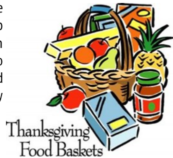
Thanksgiving Food Baskets

Bring the love and warmth of Christ into someone's home this Thanksgiving by providing a meal to a family in need. Every year our church adopts ten families (6 at LW + 4 at AV) to provide Thanksgiving food items to help spread the love and blessing of Christ. Sign up sheets are at both campuses with various items listed to contribute to these dinners. Please bring the food (not cooked) to the church by November 18.