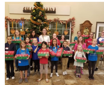
AHG Operation Christmas Box