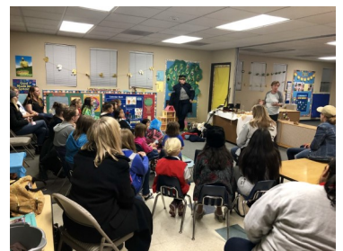
AHG Civil War Days