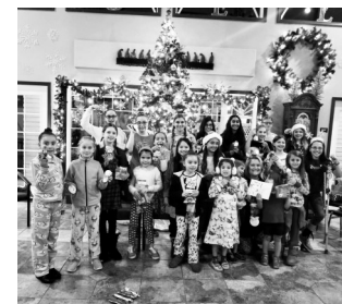
AHG Black and White Christmas