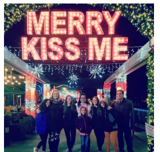
Dana Point Harbor Fun