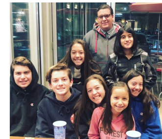
Fun with LCC Friends