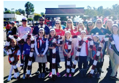
AHG Goes to Laguna Niguel Holiday Parade