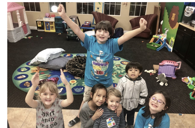
Kids Nite at Laguna Woods