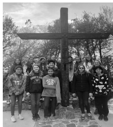
MS Youth Forest Home Winter Camp

Youth Ministry at Lutheran Church of the Cross seeks to help students become firmly rooted, built up, established, and overflowing with thankfulness toward Jesus.