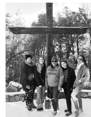
HS Youth Forest Home Winter