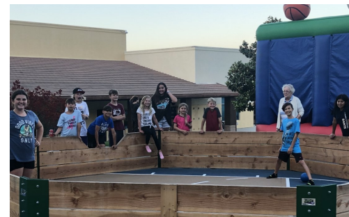
MS Summer Big Bash Nites were awesome! Next one: Thursday, September 26, 6-8pm at AV