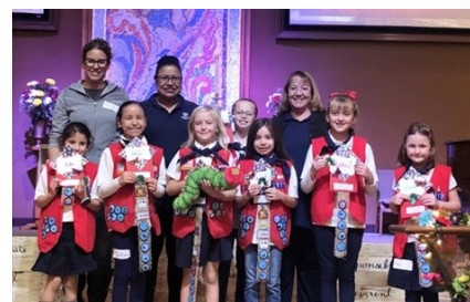
AHG Troop CA2517 Court of Awards 2020