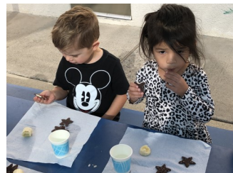
(Left to right: snack, sensory tub, art, shaving cream)

In January, the students wore black and/or white to school and enjoyed "Black & White Day" with fun activities focused on the colors black & white.