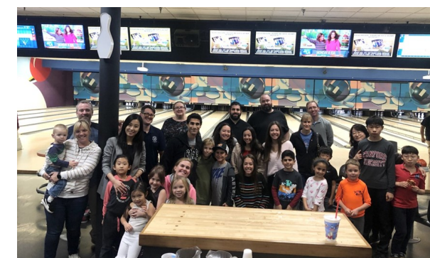
January 2020 Family Fun Event – Lake Forest Bowling