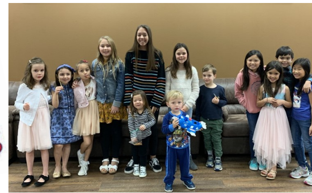
January AVCS 1st Grade Special Music @ AV